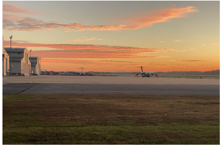
Sunrise at work