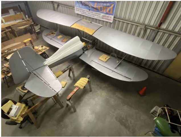
A recent photo highlighting the progress made on the Stolz SA-900 V-Star.