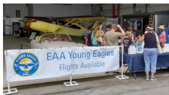
Young Eagles Event

Monthly chapter meeting on Tuesday, May 6th, 7:00 p.m. at the Hagerstown Aviation Museum hangar.