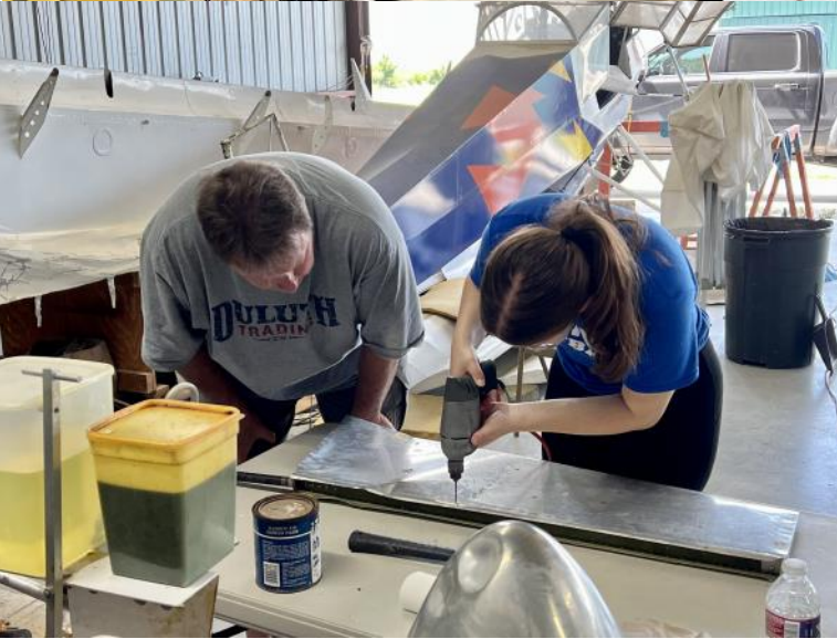
Putting the skills to work and finding it a tedious process