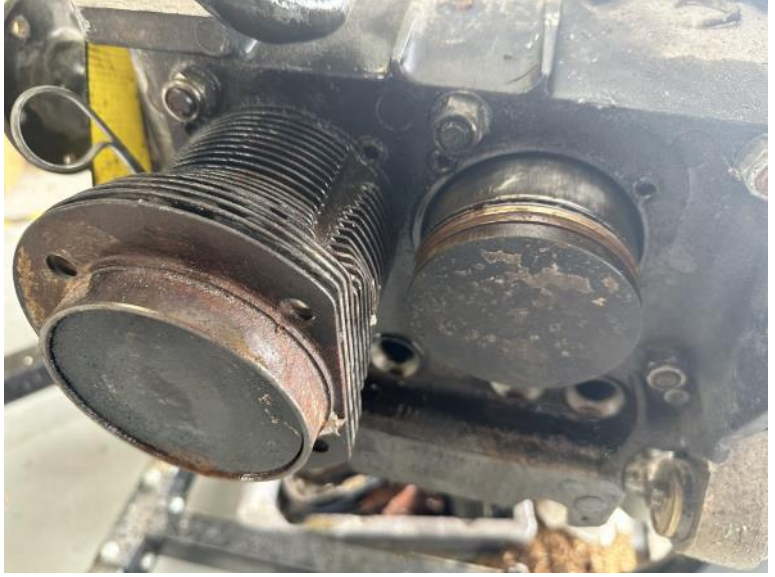
The passenger side cylinders are in much better shape. Zane and Ethan's enthusiasm for the project is awesome!