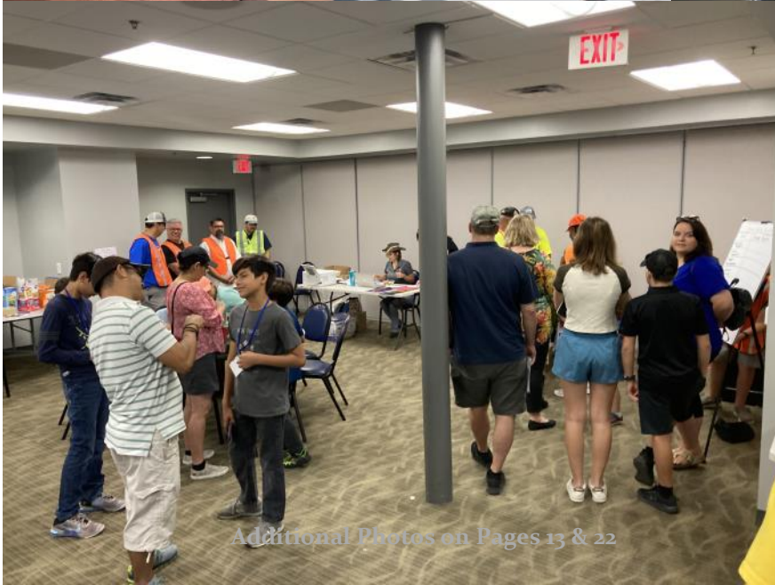
Additional Photos on Pages 13 & 22