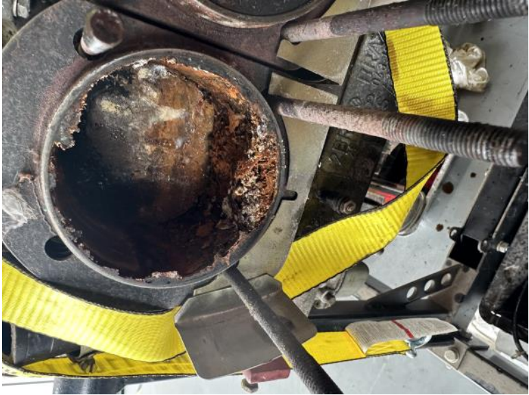
This cylinder is very corroded!