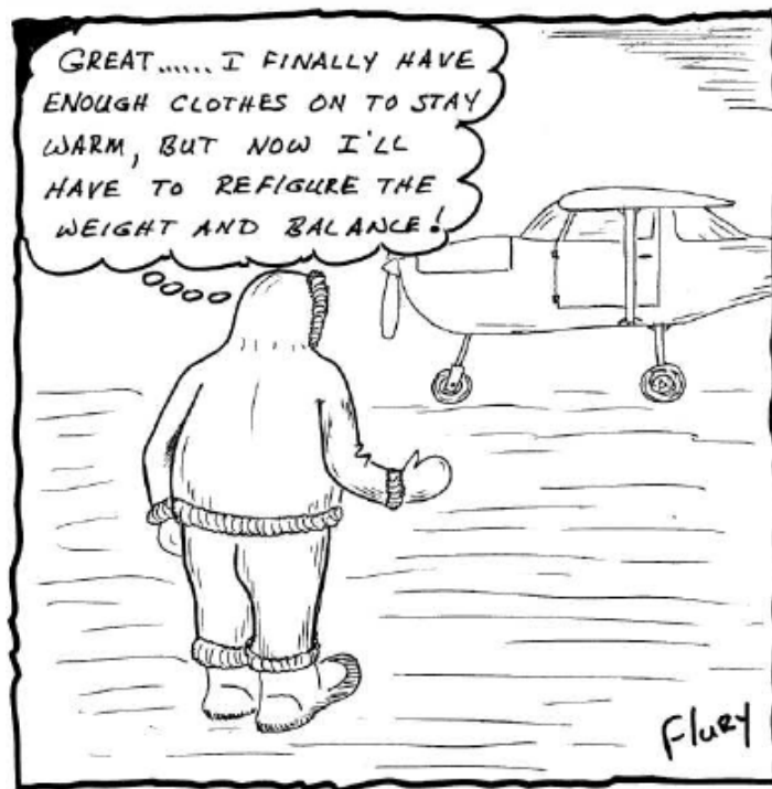
One of the hazards of winter flight instruction!

July 12 Zangger Vintage Airpark Fly-In Super Flying activities begin at 1300 with a Poker Run, Flour Bombing and Spot Landings. BBQ Pork Supper from 1700-1900 and Hot Air Balloons until dusk.