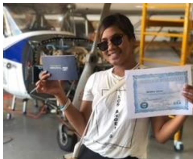
One of the Young Eagles showing off her logbook and certificate