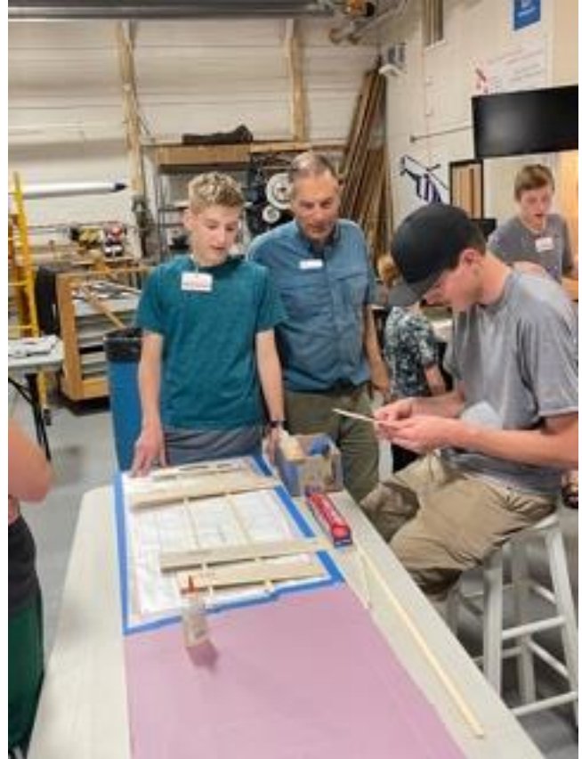
Building a wing for RC plane.