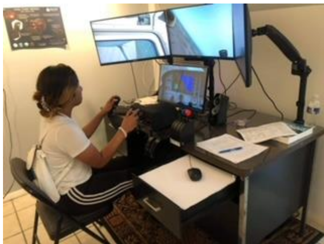
Simulator in use at Young Eagles event.