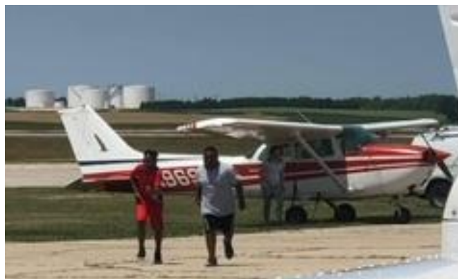
Kids running joyfully from Bill Fitch's plane.