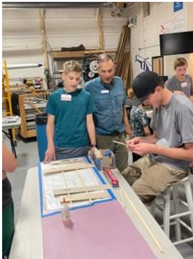
Building a wing for RC plane.