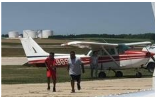
Kids running joyfully from Bill Fitch's plane.