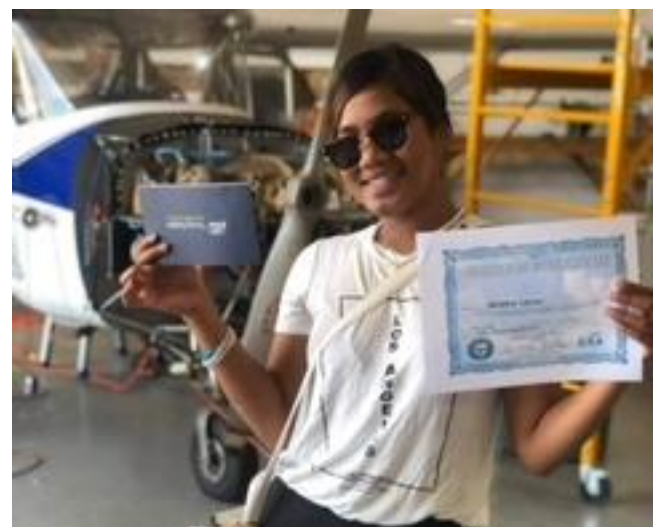
One of the Young Eagles showing off her logbook and certificate