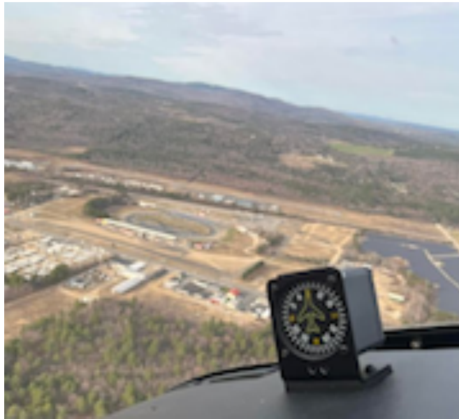
Oxford County Airport (81B)