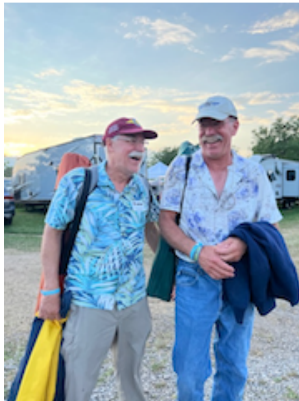
Good friends, good times