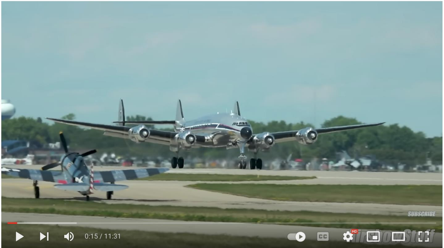
Daily Oshkosh Highlights! - Saturday - EAA AirVenture Oshkosh 2023

Here's a taste of AirVenture: https://www.youtube.com/watch?v=YwV3xNeKK5o