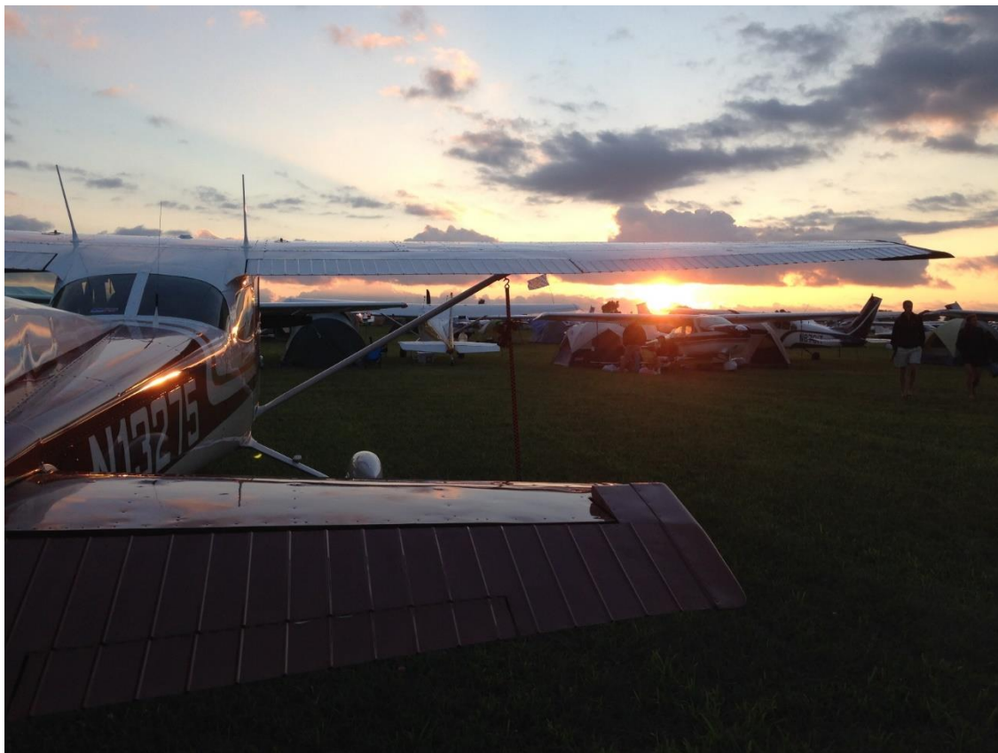
"Sunset at Oshkosh with Cessnas2Oshkosh" Jul 27, 2014, 8:07PM