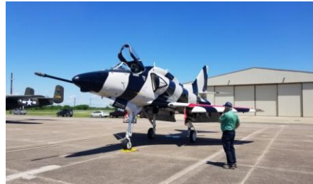
Douglas A-4 Skyhawk