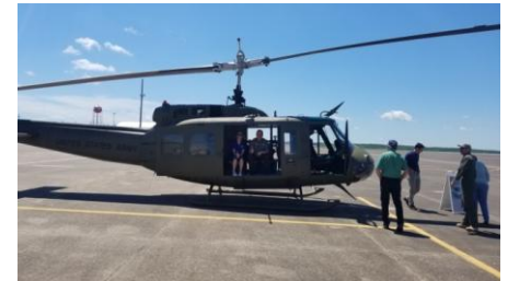
Bell Helicopter UH-1H Iroquois