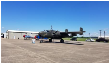
North American B-25H Mitchell