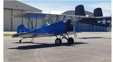
Boeing PT-13C Stearman Kaydet