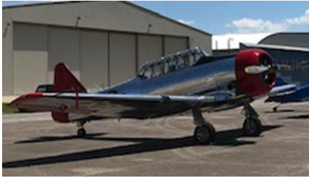
North American AT-6/SNJ Texan