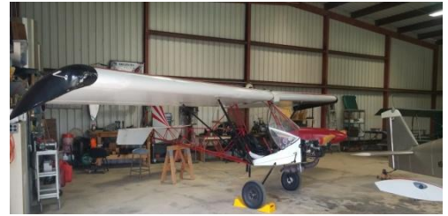
Ed purchased an Ultralight