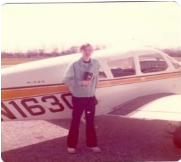
Future airline pilot extraordinaire

From the photo one can see that I was there and there is some 8mm film that proves I went up and survived a landing in the Cherokee. (It is still flying.) That was all it took.