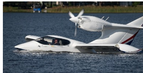
Seawind 3000 (NOT the one in the story)

“I radioed to the tower for a test flight over the airport,” Collier wrote. “Climbing to 500 feet above pattern altitude doing left hand turns staying within the airport’s landing pattern. After the first turn I noticed the nose up without inputs ... I set up for landing after the third time around.”