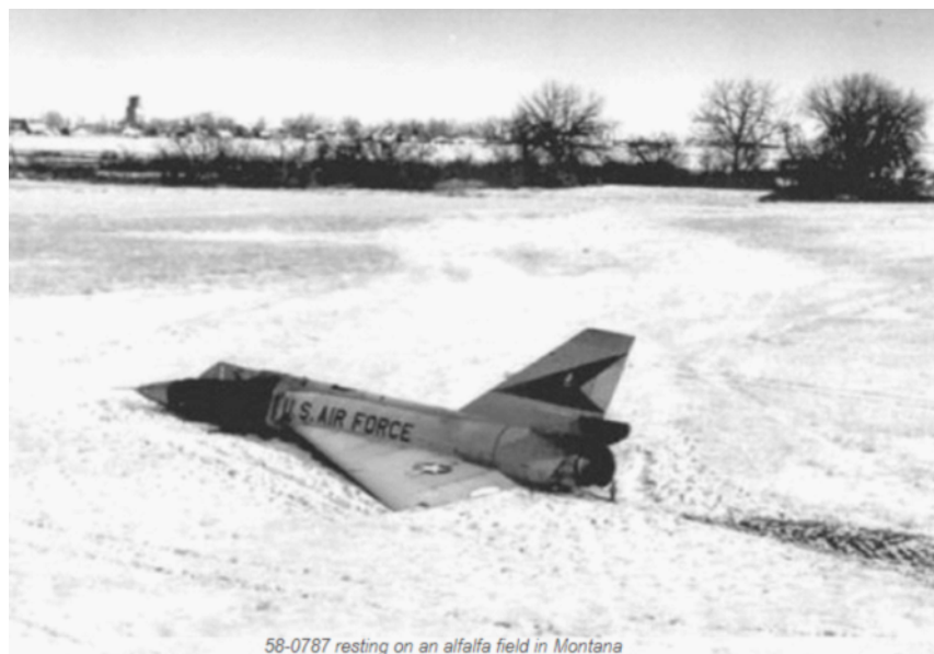
58-0787 resting on an alfalfa field in Montana

Curtis saw it all. From his angle, it looked as if the plane’s tail was doing a slow circuit around its wobbling nose – disaster! It’s called a flat spin. And once an F-106A does that, it’s almost as good as dead.