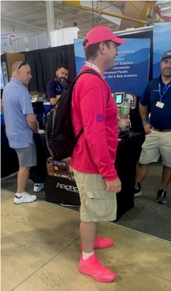
The FAA man rocking that PINK outfit

Some of the FAA peeps really get into the thick of things and really get decked out in their own pink attire.