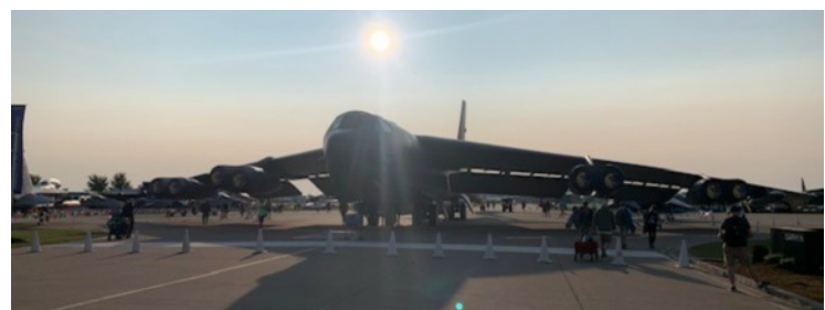
The Boeing B-52 Bomber "The BUFF!"