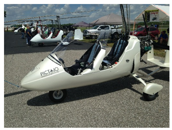
PICT 10 Auto Gyro

A flight was taken in the new PICT 10 gyro for some