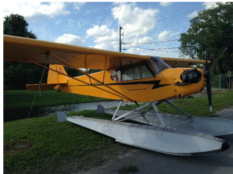
add power to taxi up to "that" taxiway and turn off the runway. Pretty cool!

Yes sir! "Make it happen!" So I just ease the control stick back until the airspeed goes to "zero," then lower the nose, kick a little rudder to get the wind to push the gyro backwards down the runway. At the precise altitude you start the flare and round out which, with the 20 mile per hour wind blowing, has the Gyro hovering over the same spot we were flying over just moments ago. After the smooth touchdown, the nose wheel touches and we