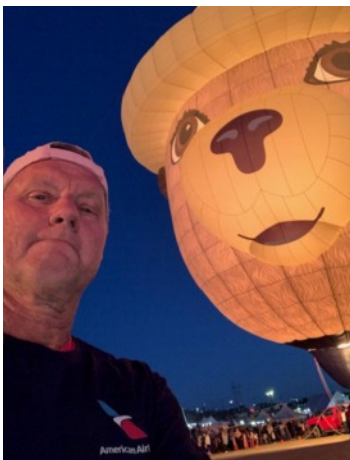
Smokey at the Thursday night Balloon Glow