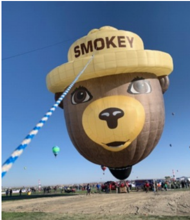
The NEW Smokey Balloon