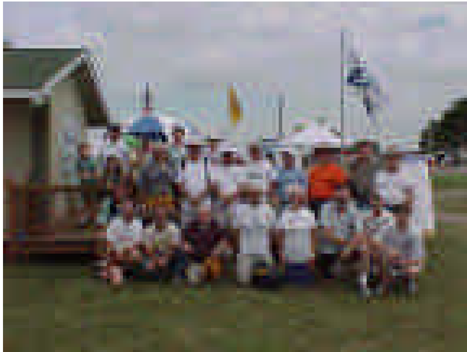
The gang at Oshkosh 2002 (at least those who could make it)

Welcome back, all you lucky folks who got to go to Oshkosh this year. Here's hoping your vacation travels were safe and relaxing. Now it's time for another meeting in our new, almost-finished hangar (a.k.a. the ARC) Please drop whatever you're doing on Sunday August 25 and join us at 2:00. Same airport, same building, same friendly faces.