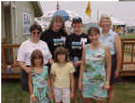
The Ladies of Chapter 32 (I'm told not to expect a calendar anytime soon)