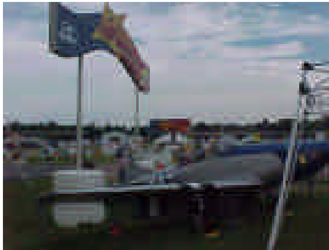
Once again, the Baker P-51 delights the younger set at KidVenture