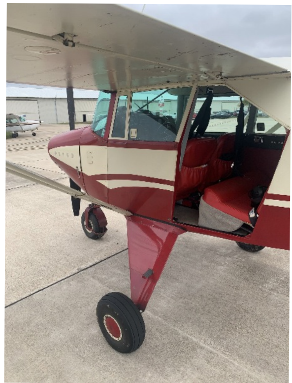
A simple airplane with its back door off.

And the winning airplane in the pumpkin drop for the last two years.