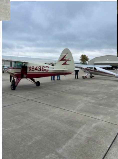
The plane that won last year. Rear door removed. Gets a better target view and drop point