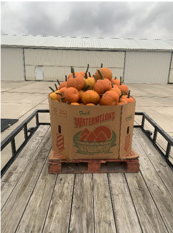
A simple box of Pumpkins