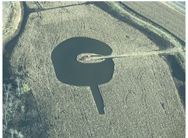
Duck Blind with reflecting geese decoys

Well gang, THANK YOU ALL! For a FUN YEAR, a SAFE YEAR, and a HAPPY NEW YEAR just around the corner.