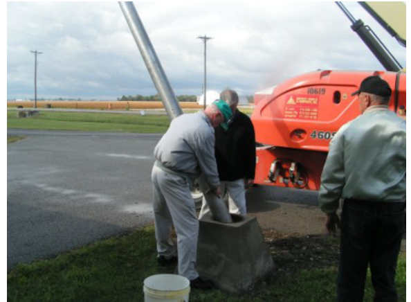
Step 4. "Keep her coming, boys!"