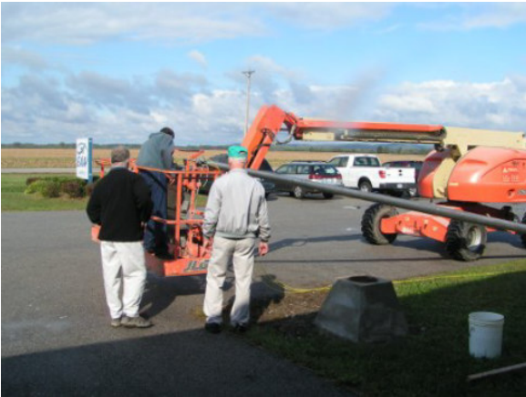
Step 1. Tie the top of the flagpole to the cherry picker.