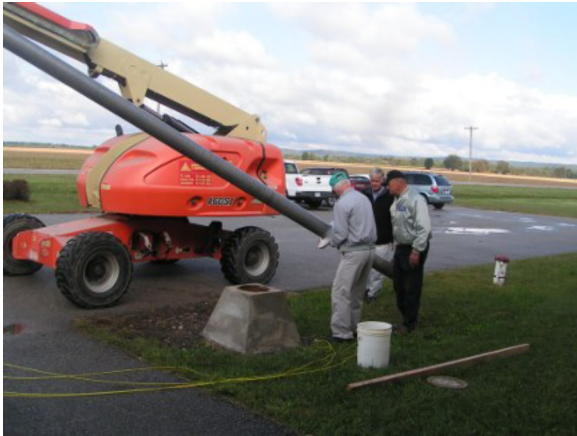
Step 2. Lift the top of the flagpole with the cherry picker while moving the bottom to the base.