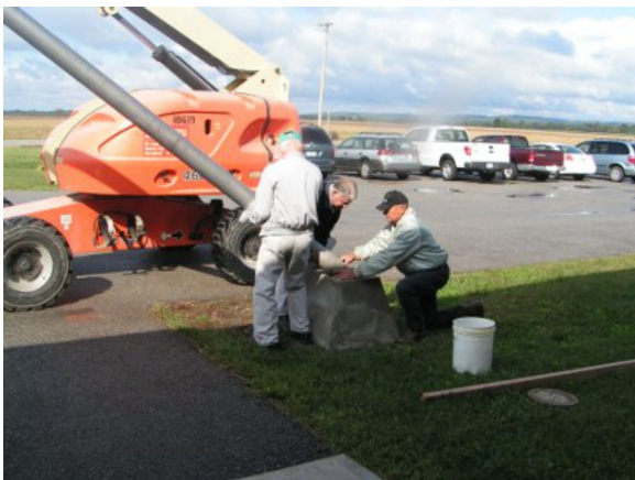
Step 3. CAREFULLY put the flagpole bottom in the base.

Step 6. "I'm sure glad I remembered to put this collar on the pole BEFORE we raised it!"