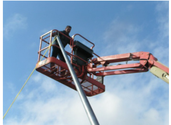
Step 5. All projects need an expert operator.