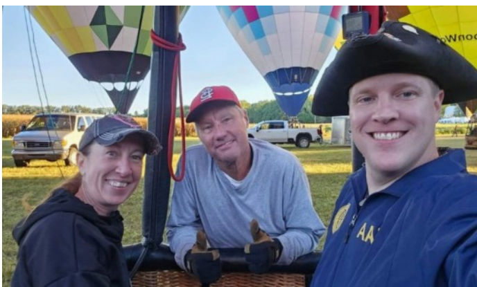
Crewing for Captain “HOOK” in Indiana