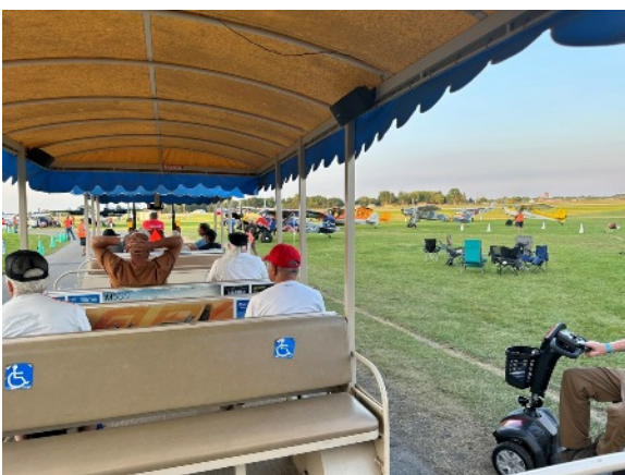
Paused for STOL