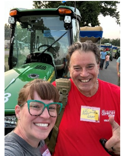
Our Tram Team

I hope that next year I'll get to check back in, and say I made the rides a little better for everyone - volunteers included - with fun facts and aviation jokes. If you have fun facts you think riders would enjoy - send them my way!