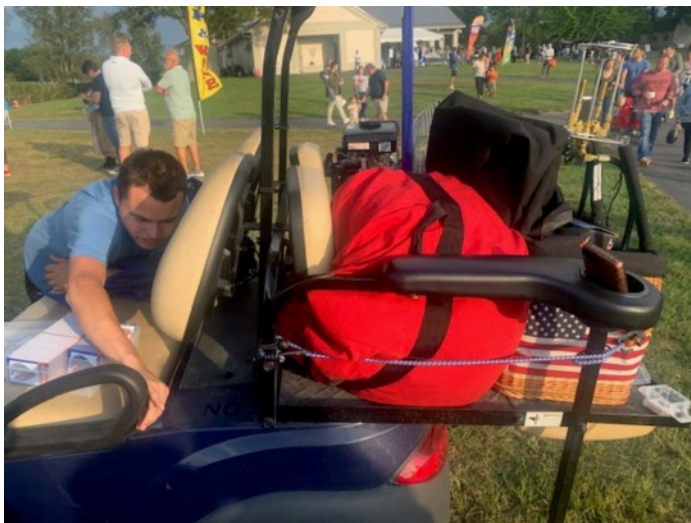
This young man has a RC-Remote Control Balloon

But enough about this HOT AIR stuff. The EAA 32 Learners were at the 2024 LSA Light Sport Aircraft event at Mount Vernon, IL this year.