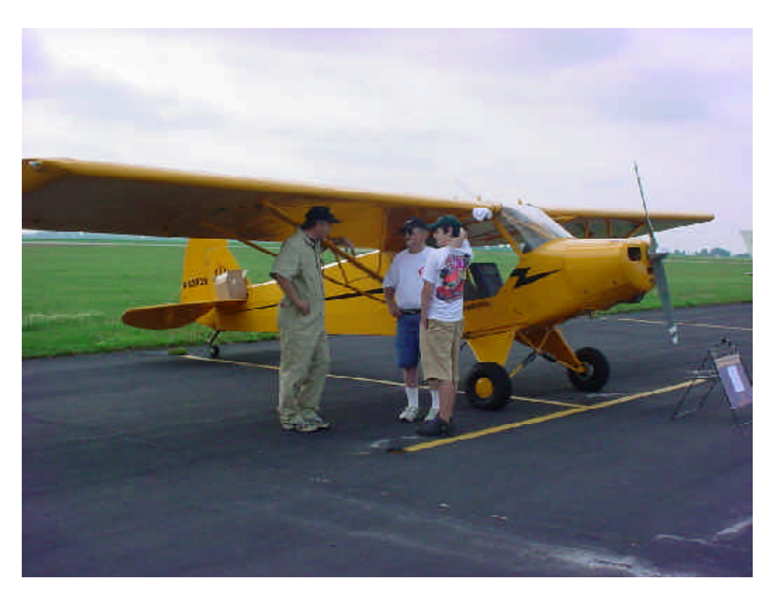
A great Piper Cub replica

Sunday, September 25th - 1pm BBQ; 2pm General Meeting; following the meeting - Program TBA