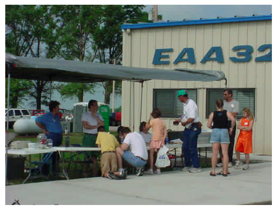
We flew about 30 Young Eagles on Saturday, not counting moms and dads. Thanks to all our great pilots and ground crew!