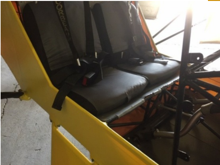
New seat cushions!