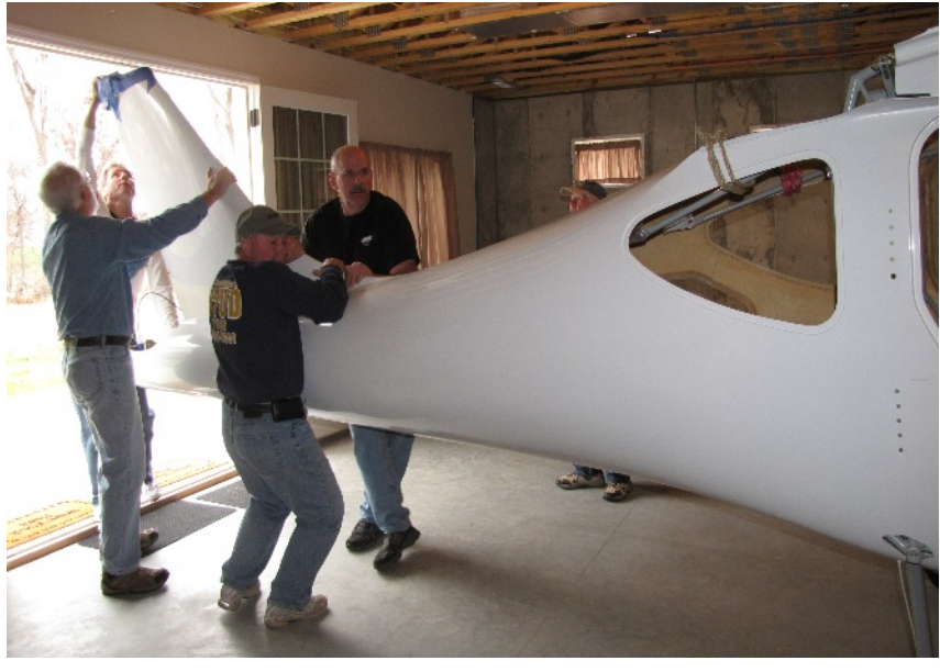
The get 'er done gang!

Within minutes the gang was riding their bikes over to see the latest addition to the airpark. The machine was to be placed in the hangar but the old builders rule of "if it is not within 75 feet of where you sleep you will work on it 50% less of the time." So the suggestion was tossed out, "Why don't we put it in the basement of the house where you WILL work on it instead of the chilly hangar." Well, you know I will get it later. Now is later