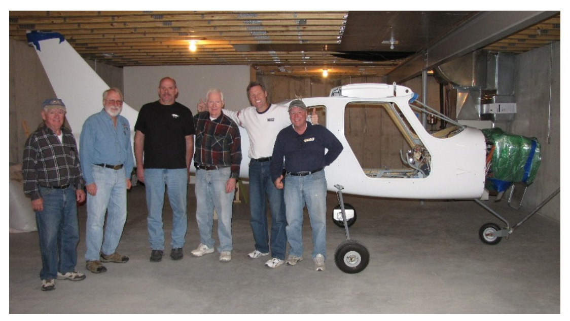
The Boys from Troy's Airpark

Well, as darkness fell upon the airpark the little KR-1 was wheeled out of the museum, tied down to a stake, filled with 2 gallons of 100 Low Lead go juice, and after