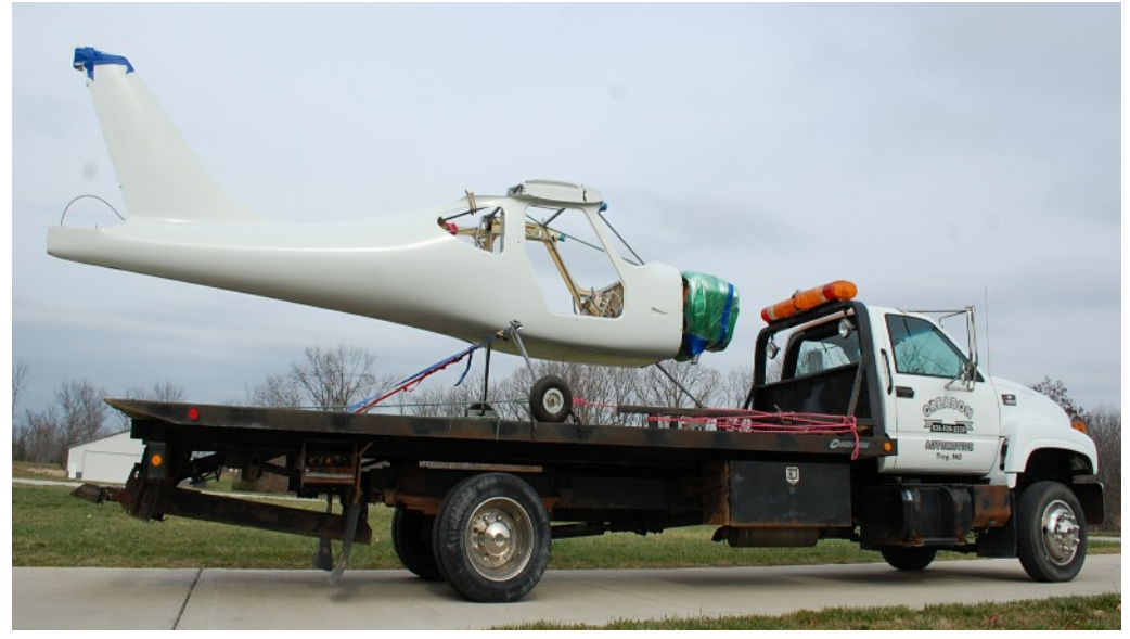
Mr. Joe's awesome moving machine

Well with the Glastar resting in the lower level of the BT humble abode the work party was dispersed and lunch was finally consumed.