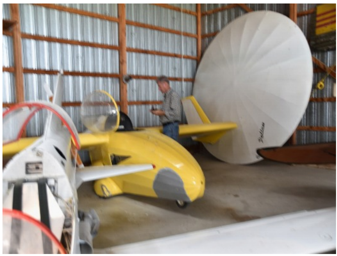
The old Plank II (yellow) with the Parasol wing of the Van Dellen Parasol aircraft of Pella, Iowa.

Had a chance to visit the AAA Antique Aircraft Association in Blakesburg, Iowa is past weekend. What a nice old fashion gathering of some old flying machines there. NICE!