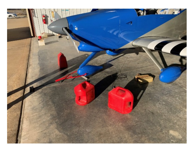
The left tanks 7 gallons (indicated) that was actually 5 gallons.