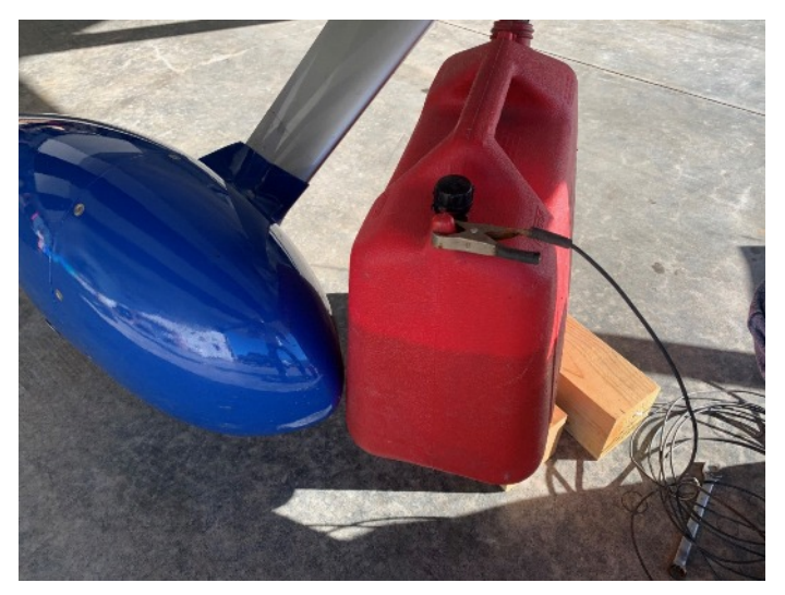
The right tank's 6 gallons (indicated) that was actually 4 gallons.

After a zero-ing of the fuel gauges, (and a quick weighing of the aircraft for the new Weight and Balance) we put in fuel at 5.0 gallon intervals to the fuel tanks and set the gauges. Now with this approved process the fuel indicators WILL read with more accuracy. A good thing to have!