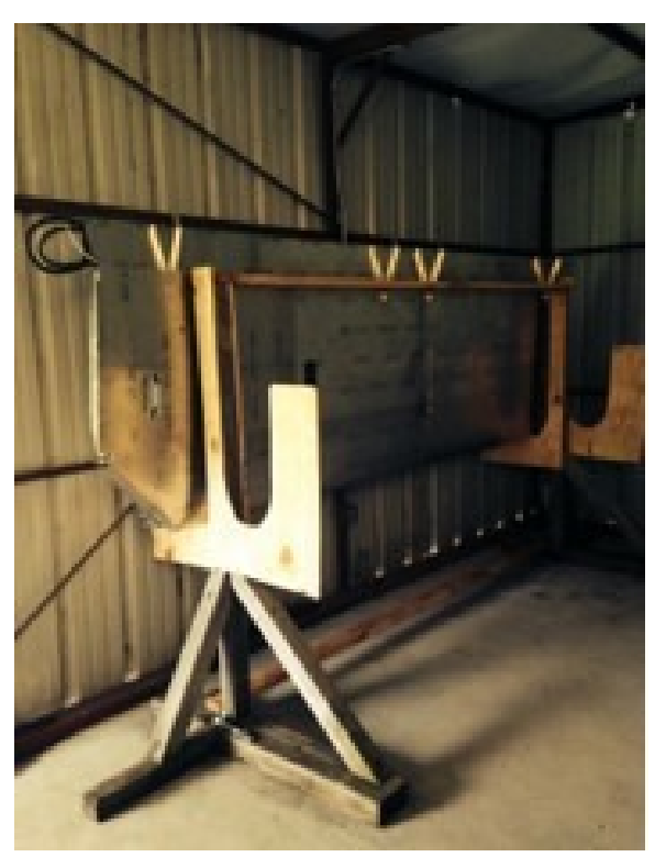
This is the first stands that I build to hold my wings. This stand I called my wing tree.