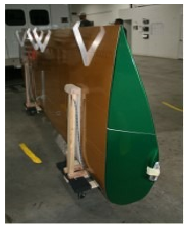
The wings have now been wrapped and look a lot better. This is how the wing looks to-day on the stand built by Frank.