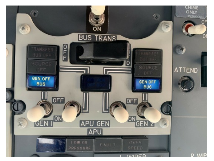
Boeing 737NG electrical panel

When I was hired at TWA in 1989, I was a flight engineer (a systems specialist sitting behind the captain and co-pilot) on the Boeing 727. All those round gauges were a lot to take in. Passengers would look in the flight deck and always asked if we knew what ALL THOSE GAUGES do! The usual answer was, "We have learned most of them!" Now some 32 years (in January) later, our EXPERIMENTAL aircraft are more sophisticated then the airline jets. While my instrument panel on Boeing B-737-800 NG is the latest and greatest flight instrumentation, the overhead systems panel is STILL the same panels that I had on the Boeing 727-200.