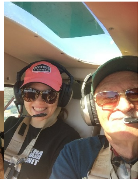
One church intern and two young eagles!