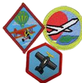
Aviation Merit Badge Workshop