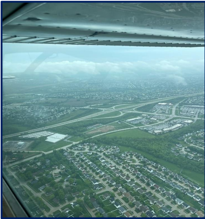
The wall of rain that stood in the flight path to Washington, MO

So back on the ground at Smartt Field, and after waiting for 1 hour, the sun made the sky brighter as it rose in the sky.... We decided to try the flight again. This time we got as far as Lake Saint Louis, MO and highway 61 when another WALL OF RAIN had us turning around again.