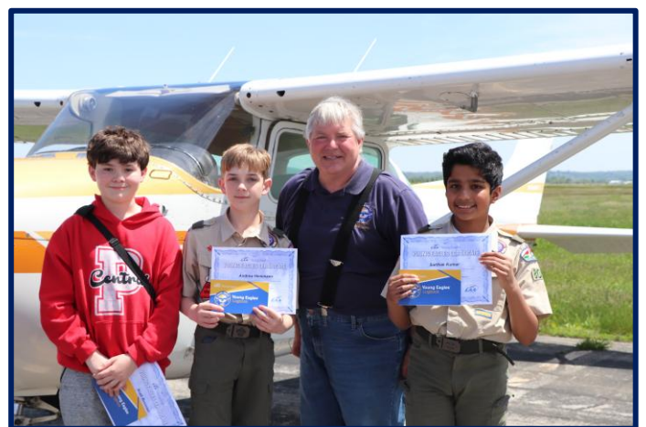
Three current Parkway Central 6th graders flew with a retired former Parkway Central 6th grade teacher