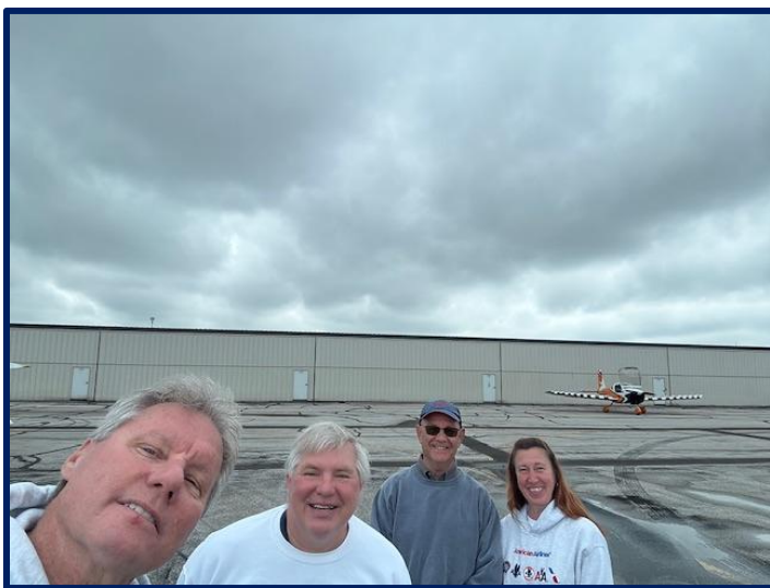
The pilots ready to fly!

So, two of the happy people from this group of pilots in the photo below, jumped in their airplanes and started the 33nm (38 statute mile) flight to Washington Regional Airport in Marthasville, MO from Smartt Field. WHAT COULD GO WRONG?