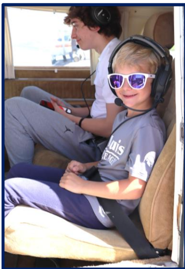
Some passengers have more leg room than others