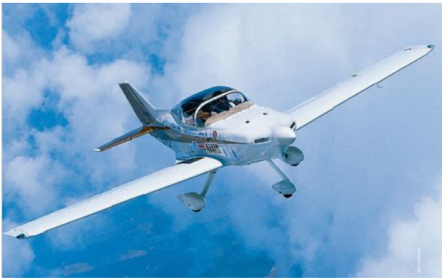
Dan Biesemeier's Smyth Sidewinder