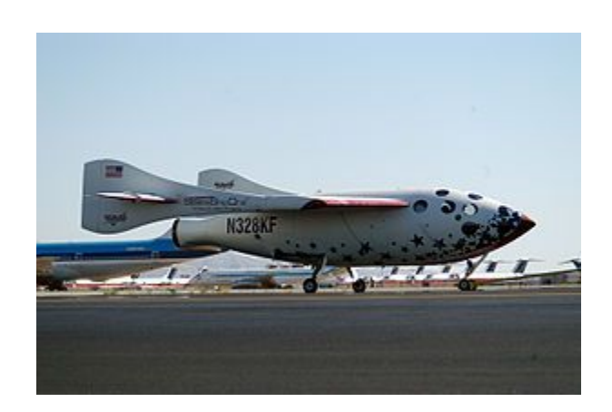
Spaceship One on the ramp

The bottom inset showed a head-on image of Scaled Composit's White Knight, built to carry SpaceShipOne aloft, also with the goal of reaching an altitude that would qualify as a trip to space. At a press conference at the 2003 Sun 'n Fun, Burt Rutan explained that the White Knight mother ship would carry SpaceShipOne to an altitude of approximately 50,000 feet, where it would be released, and its rocket engine would take it the rest of the way to space. It would then glide back to earth for landing. At the time their funding was said to be from an "unnamed, private source", but as we later found out, it turned out to be the late Paul Allen, of Microsoft fame, who provided approximately $28 Million. In 2004 Scaled Composites successfully flew into space, and also completed the requirements to win the Ansari X Prize of $10 Million Dollars. SpaceShipOne can be seen at the National Air & Space museum. After being used to do tests for the DARPA/Boeing X-37, White Knight was retired and is now in Paul Allen's Flying Heritage Collection at Paine Field, Everett, Washington.