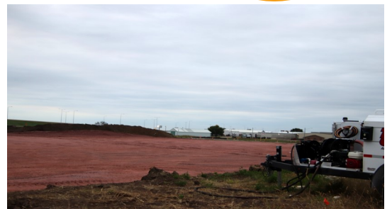
Casey's General Store Construction Site N of Airport

EAA 289 Pancake Breakfast & Board of Directors meeting 8 am October 16, 2021