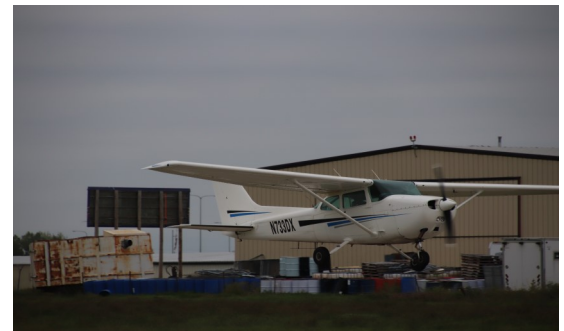
Right: Taking Off Y14.