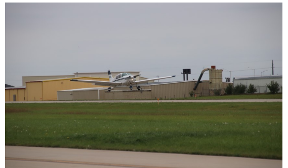
Right: Landing Y14