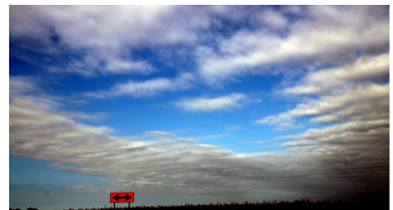
Right: Clouds in Area