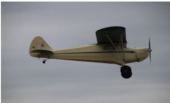
Left: Taking off