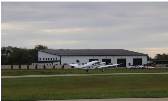
Left: Taking Off.