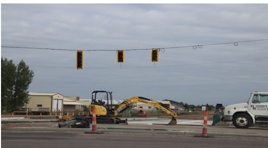
Left: Road Construction in area.