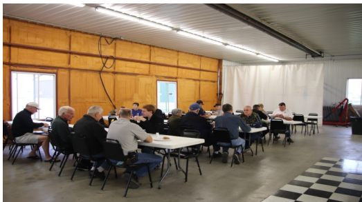
Breakfast Crowd Y-14

Mailing Address: PO Box 89105 Sioux Falls, SD 57109