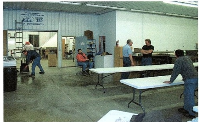
The Thursday night Builders Group hard at work setting up for the banquet...kind of reminds you of a highway work crew, doesn't it? Just joking - the Group had the Chapter building cleaned and set up in short order.