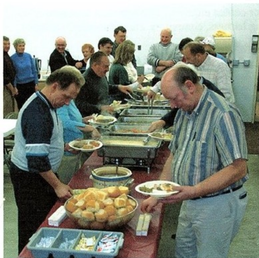
The tasty meal was again catered by Fiesta Foods of Lennox.