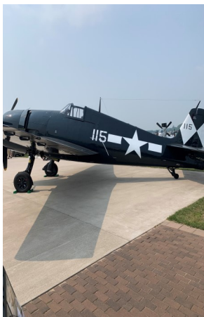
USN GRUMMAN F6F HELLCAT FIGHTER