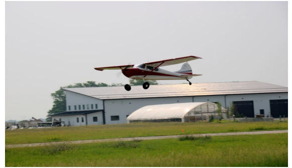
Right: Taking Off.