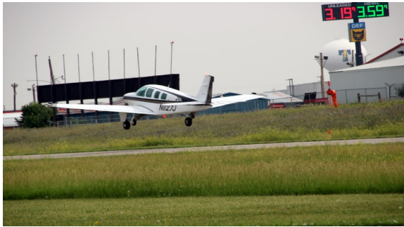
Left: Taking Off