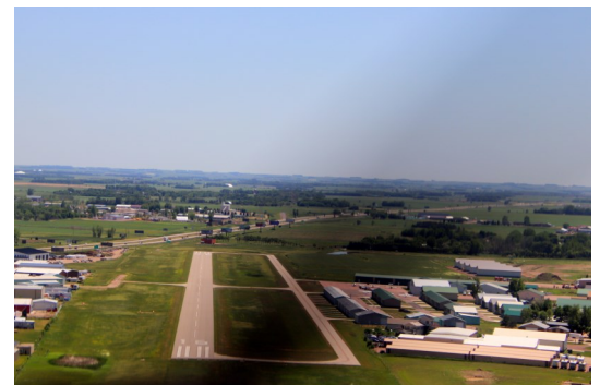
EAA Chapter 289, Lincoln County Airport, & Chapter Hangar Below Tea, SD

Or send to EAA 289, PO Box 89105, Sioux Falls, SD 57109