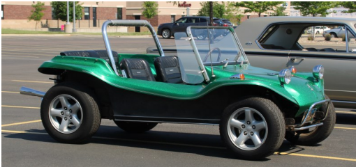
Dune Buddy, Sertoma Car Show June 3, 2023

289 Facebook Link: https://www.facebook.com/ea289/ 289 Website link: https://chapters.eaa.org/ea289 CAP Lobos Facebook: https://www.facebook.com/lincolncap/