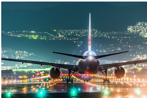
Airliner Taxiing on night runway