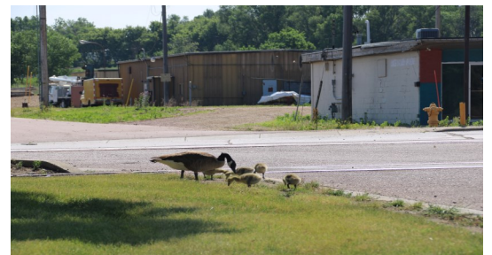
Mother goose and babies by Falls Park, June 2023

EAA 289 Pancake Breakfast & Membership Meeting 9 am July 15 Wings & Wheels August 19, 2023 September 16, 2023