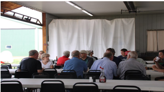
Crowd June 17, 2023

Mailing Address: PO Box 89105 Sioux Falls, SD 57109