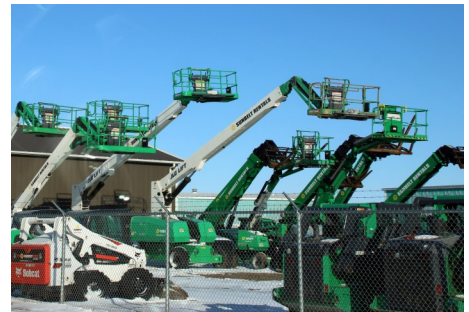
Fork Lifts Sunbelt Rentals eastside of Y-14. 3-18-2023

EAA 289 Pancake Breakfast & Board of Directors meeting 8 am April 15, 2023 May 20, 2023 June 17, 2023