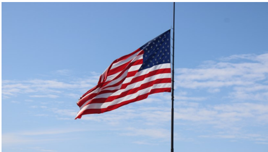
Flag by Dow-Rummel Village

Mailing Address: PO Box 89105 Sioux Falls, SD 57109