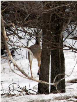
Deer cropped view West of Ellis, SD 3-5-2023

289 Facebook Link: https://www.facebook.com/ea289/ 289 Website link: https://chapters.eaa.org/ea289 CAP Lobos Facebook: https://www.facebook.com/lincolncap/