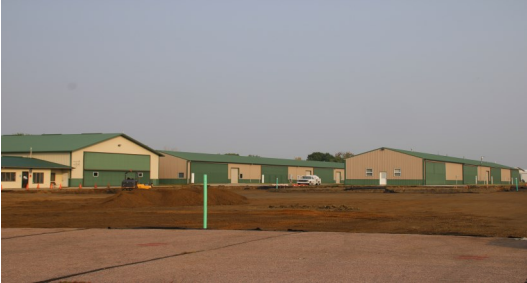
Parking Ramp at Y-14 being redone September 16, 2023

EAA 289 Pancake Breakfast & Membership Meeting 9 am October 21, 2023 Next Breakfast Spring 2024