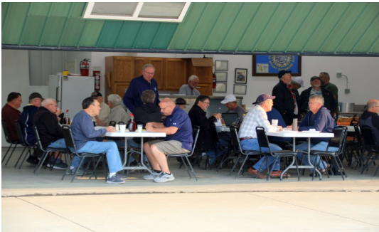
Crowd September 16, 2023

Mailing Address: PO Box 89105 Sioux Falls, SD 57109