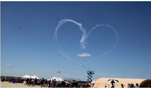
Vanguard Squadron at SF Airshow 2023

289 Facebook Link: https://www.facebook.com/ea289/ 289 Website link: https://chapters.eaa.org/ea289 CAP Lobos Facebook: https://www.facebook.com/lincolncap/