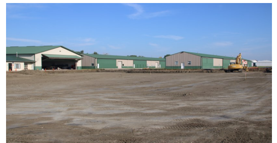
Parking Ramp at Y-14 being redone August 19, 2023

EAA 289 Pancake Breakfast & Membership Meeting 9 am September 16, 2023 October 21, 2023 Next Breakfast Spring 2024