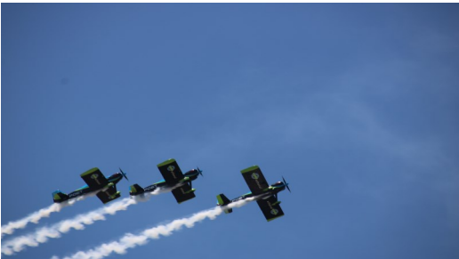
Vanguard Squadron at SF Airshow 2023

289 Facebook Link: https://www.facebook.com/ea289/ 289 Website link: https://chapters.eaa.org/ea289 CAP Lobos Facebook: https://www.facebook.com/lincolncap/