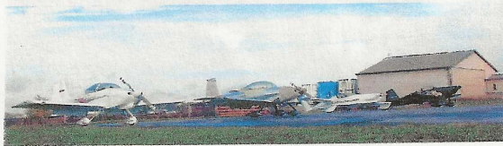
RVs and a lonely Dragonfly

In spite of early rain, which cleared up nicely by mid-morning, aviators came in from as far away as Omaha, Sioux City, and other cities in Iowa, Minnesota, and South Dakota. We love the RVs but it was particularly nice to see the Flybaby, Corben Baby Ace, Pitts, and other older designs.