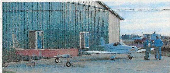
KR-2s – Before and After