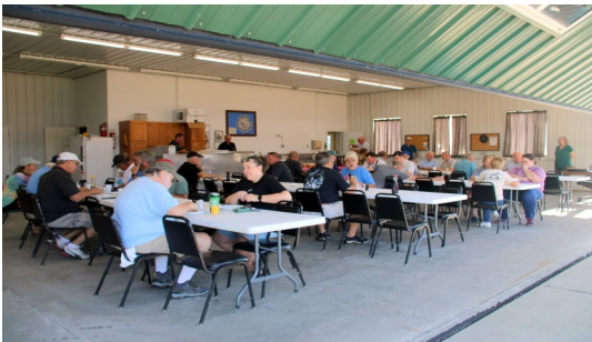
Crowd August 19, 2023

Mailing Address: PO Box 89105 Sioux Falls, SD 57109