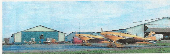
We always like to see the Vanguards RV-3s