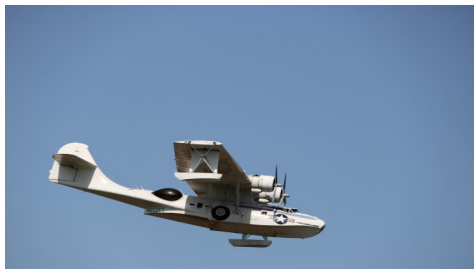
PBY sea plane Granite Falls, MN Airshow 6-2022