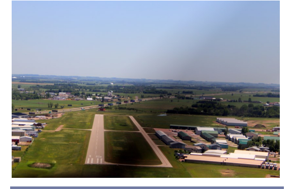
EAA Chapter 289, Lincoln County Airport, & Chapter Hangar Below Tea, SD