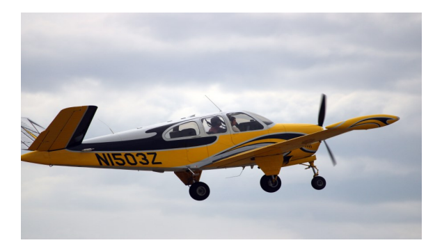
Left: Traffic at Y-14. Right: Airplane display.