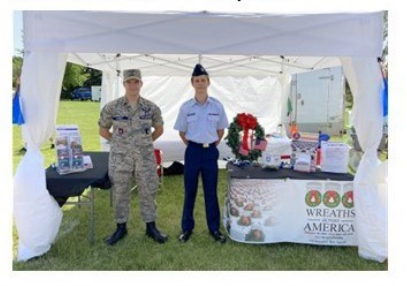
LCCS had an Information and Recruiting Booth at this year's Teapot Days. They also promoted Wreaths Across America.

Lincoln County Composite Squadron had 8 Cadets and 3 Senior Officers attend the 2022 Joint Dakota Leadership Encampment. One of the highlights was getting a ride in the Blackhawk Helicopter.