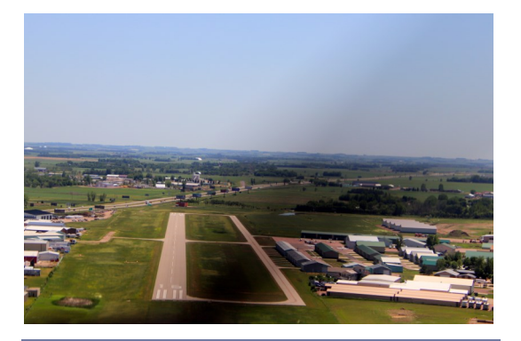
EAA Chapter 289, Lincoln County Airport, & Chapter Hangar Below Tea, SD

E-mail to <u>pethau@sio.midco.net</u> Or send to EAA 289, PO Box 89105, Sioux Falls, SD 57109