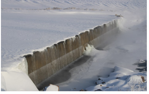
Spillway Big Sioux North of SF Airport 1-22-23