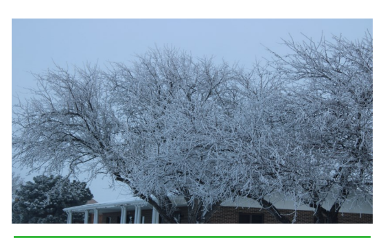
Frosty Trees by Premier Center 1-21-23

Mailing Address: PO Box 89105 Sioux Falls, SD 57109