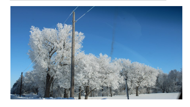
Frosty Trees & Sun by Fleet Farm, SF 1-22-23

CAP Lobos Facebook: https://www.facebook.com/lincolncap/