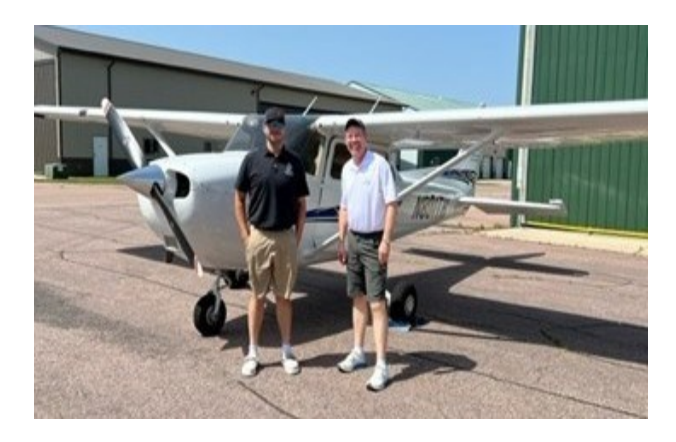
A student and instructor from SDSU flew in a RV10.

Chapter 289 Fly-In Breakfast 8 am to 10:30 am. Presentation by Sioux Falls Tower Supervisor. Noon Pizza Lunch. SD Pilots Assoc meeting at 1 pm.