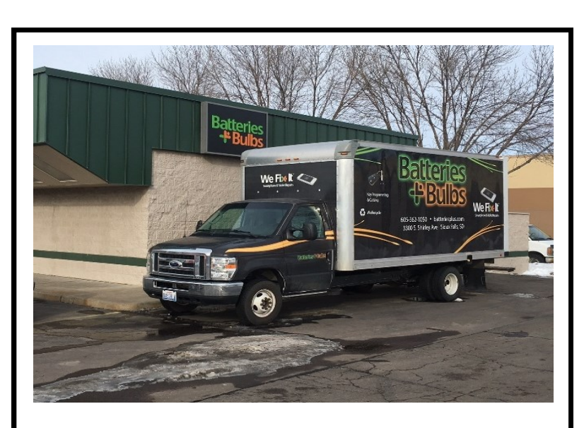
Batteries + Bulbs WE FIX IT 605/362-1050

Our Chapter accepts donations of old batteries for recycling as a fund raising activity. You can drop them off on the 'castered pallet' in the Southwest corner of our hangar. Please help us out!