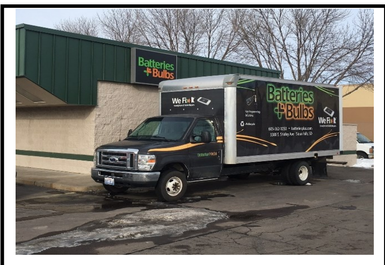
Batteries + Bulbs WE FIX IT 605/362-1050

"Making Everyday Special" 1006 W. 5th St., Canton SD 57013 605-987-4420.