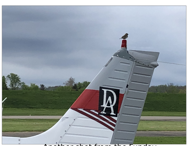
Another shot from the Funday Sunday morning in Moraine.