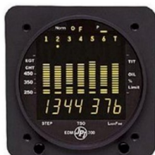
All About EGT & CHT (09/01/2010)

CHT, EGT, TIT, detonation, pre-ignition: what do they really mean?