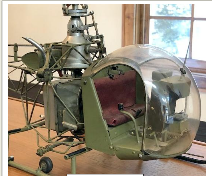
A close up of the detail work