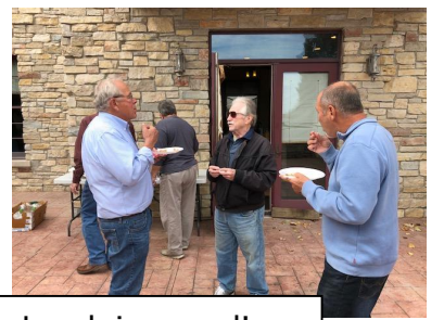
Lunch is served!