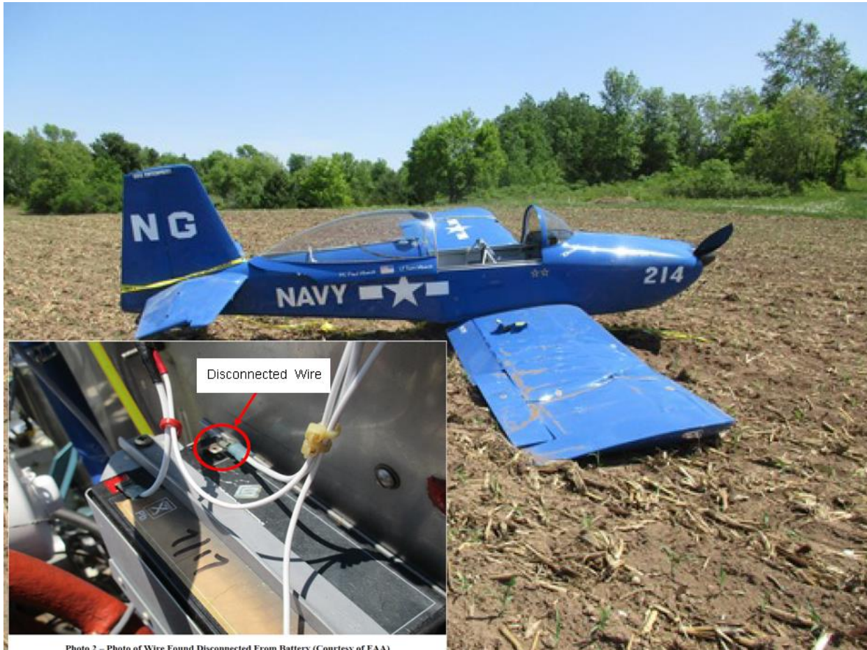
Photo 2 – Photo of Wire Found Disconnected From Battery

Examination revealed that the wire connection from the main battery to the engine's electronic ignition had melted just above the terminal attachment. Although the airplane was equipped with a backup battery, the connection from the backup battery to the ignition was disconnected, with the wire connection from the electronic ignition to the backup battery not connected to the battery terminal. While the melted wire that connected the main battery to the electronic ignition would still have allowed power to the electronic ignition from the backup battery, the lack of connection to the backup battery provided no power to the electronic ignition and resulted in the total loss of engine power. (5/28/2018)