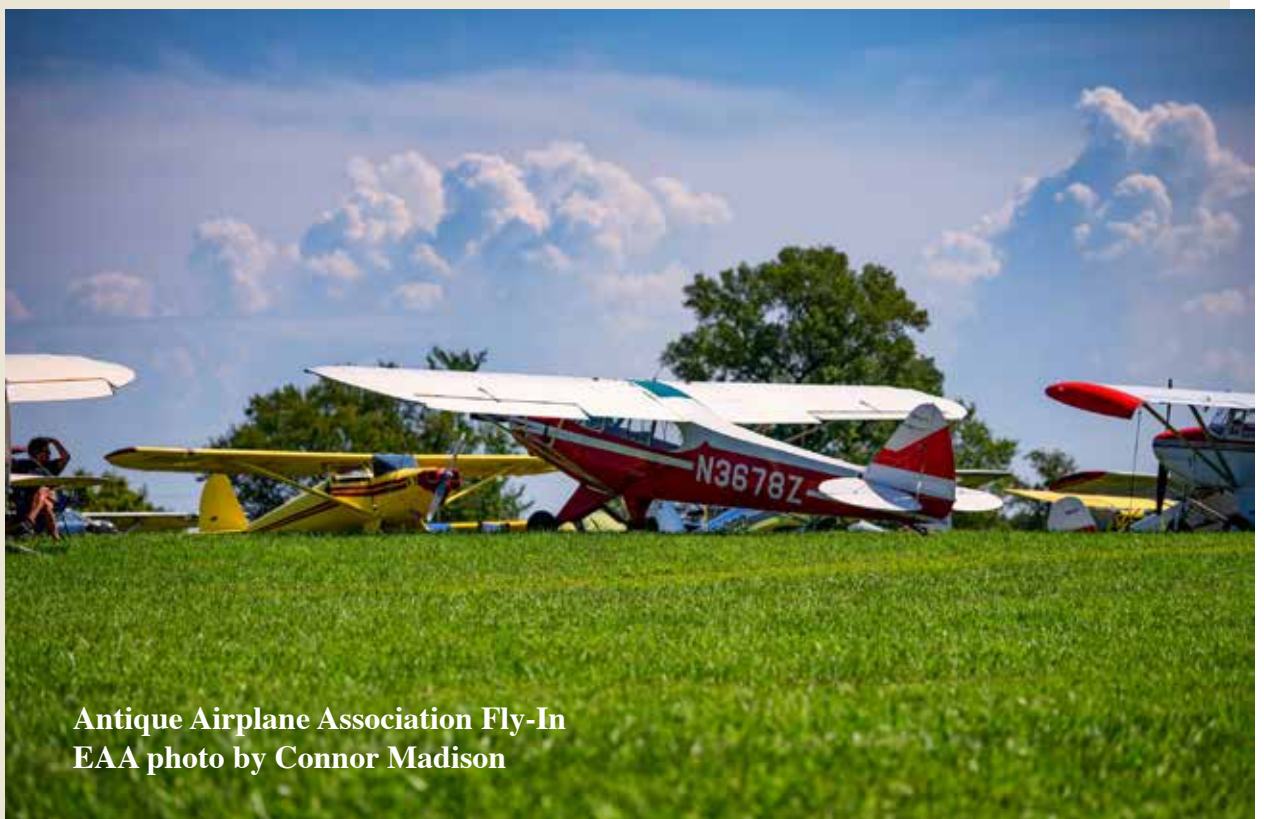
Antique Airplane Association Fly-In