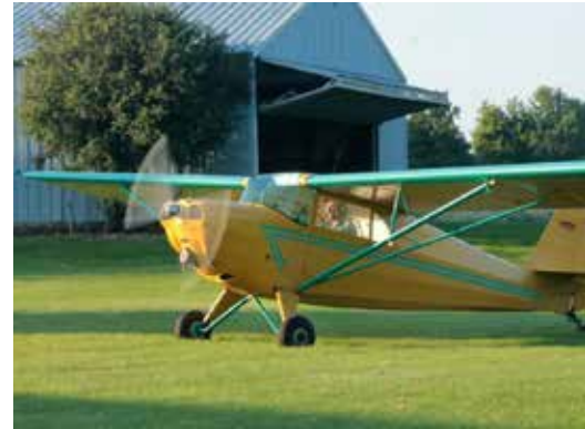
A few shots from the 2018 ELO Corn Roast and Fly-in