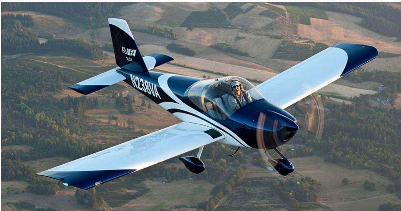
EAA RV-12 file photo (the chapter 252 teen build airplane isn't built yet !)

Join us on Tuesday, August 8, at 6pm at the Chapter Hangar for an informal open house to discuss a potential landing spot for the aircraft. If you've been interested in joining a local flying club or buying a share in a brand new aircraft, then this meeting is for you!