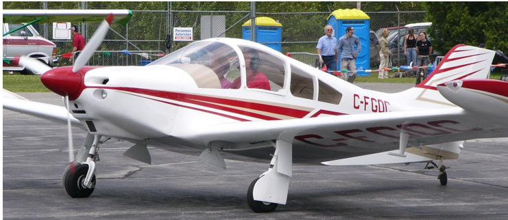
File photo— not of aircraft available.

low chapter member is interested. Contact Howard for more information.