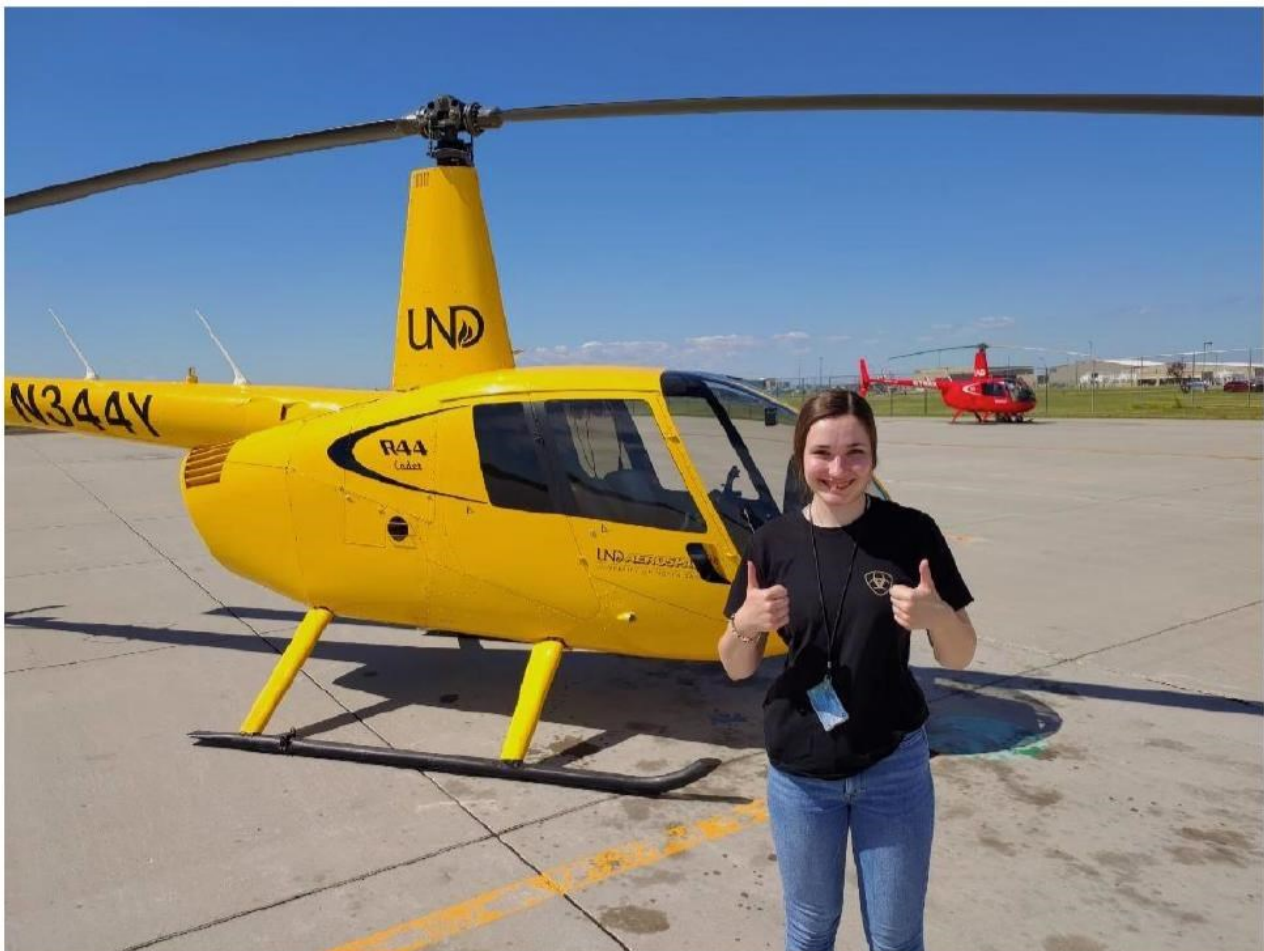
This is a photograph of me after passing my checkride.