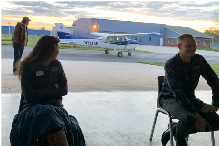
When an EAA meeting is interrupted by airplane noise, it's a good thing!