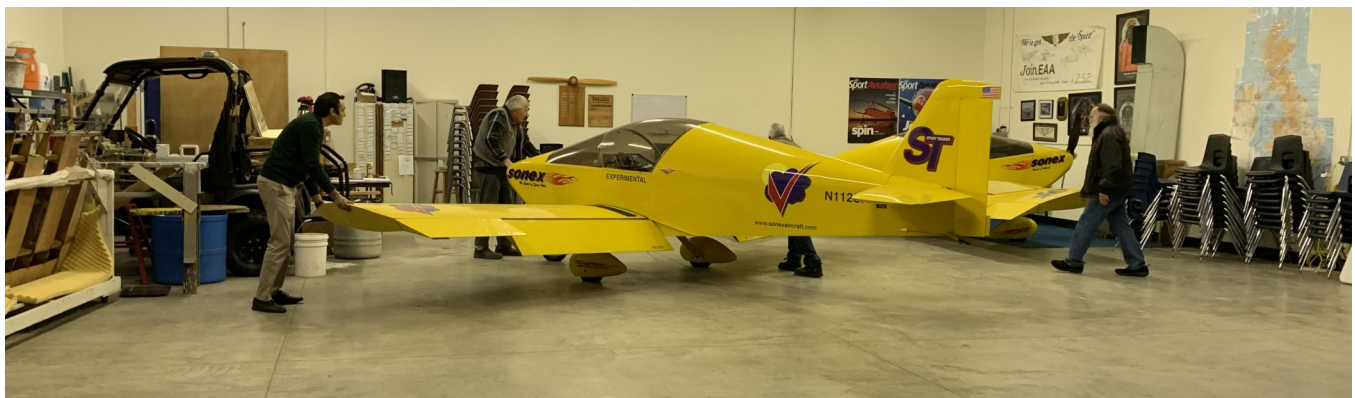
Tucking in one of our Sonex hangar tenants after the meeting.